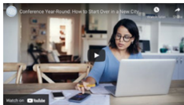
How to Start Over in a New City or Run a Virtual Real Estate Business MARCH 23, 2022